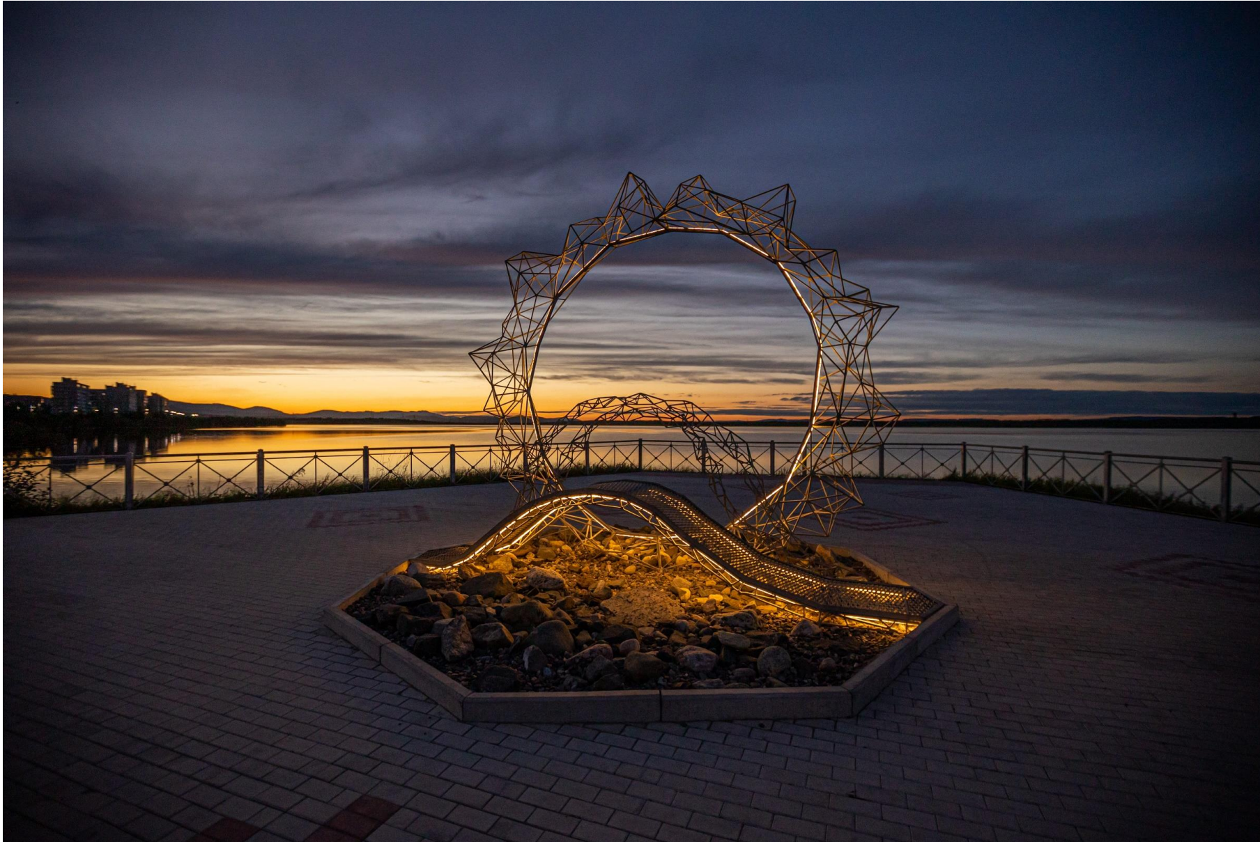
SUN CIRCLE 2021, the Murmansk region

3000 x 4900 x 1700 mm Steel. Welding. Galvanizing.