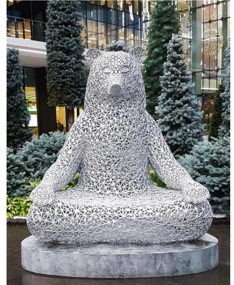
MEDITATING BEAR RAMISHI 2016

The sculpture Meditating bear Ramishi is an allegory of international friendship and mutual understanding. As a bear, Ramishi embodies the maximum degree of tolerance: the breadth of vision, embracing all worldviews and cultures with equal grace, since all living beings are united in their spiritual origin. In this approach, an unshattered and harmonious attitude to the world appears. Despite a wild dangerous nature of the animal, however, Ramishi irradiates calm confidence and kindness, so "sinking into his arms," the viewer feels warm and protected.