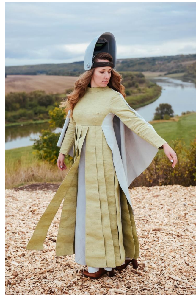
"ANGEL WELDING SUIT" 2017