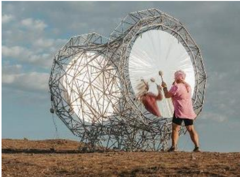
TAM TAM 2020

Weld Queen created a number of art residencies from scratch in 2020–2022, launched open calls, selected students who applied for the content, let them explore the areas where the public art was to be produced, curated all the processes inside the art residencies, delivered lectures, guided workshops on welding and curated the production of the public art objects. These works of public art are the end products of the residencies. They are able to make a person feel unified with the surrounding nature and do blend into the chosen place.