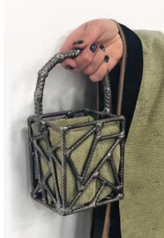
CHINESE BAMBOO MINAUDIERE 2018