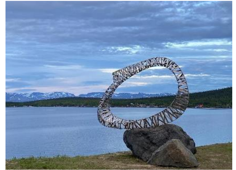
THE DREAMER 2022, the Murmansk region

3000 x 4900 x 1700 mm Steel. Welding. Galvanizing.