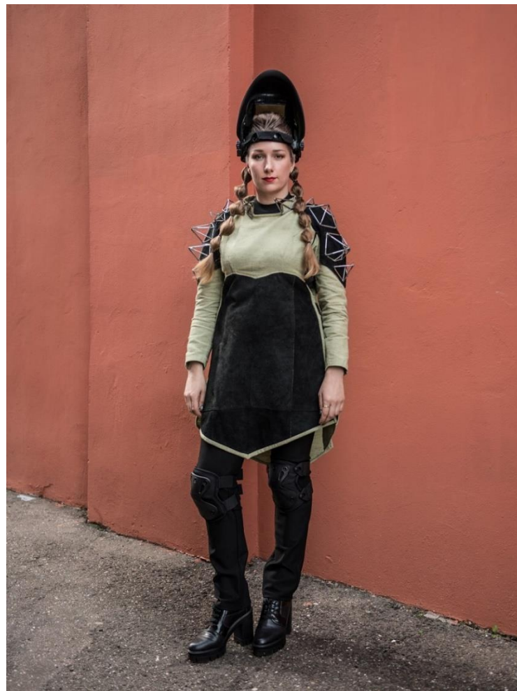
"THE GALACTIC WELDING SUIT" 2017