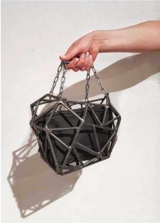
HANDBAG FOR STRONG WOMAN 2016