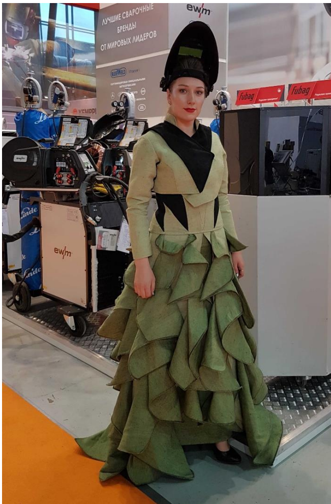
"EVENING WELDING DRESS" 2016