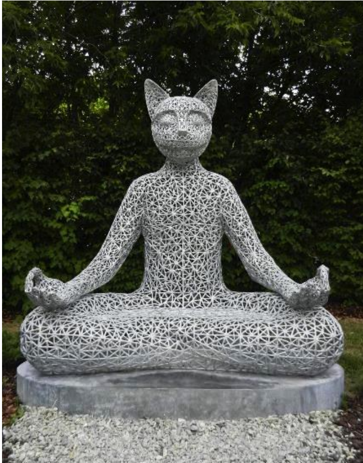
MEDITATING CAT TIKHVAMI 2015, private collection, Moscow

2300 x 2000 x 1400 mm Steel. Welding. Galvanizing.