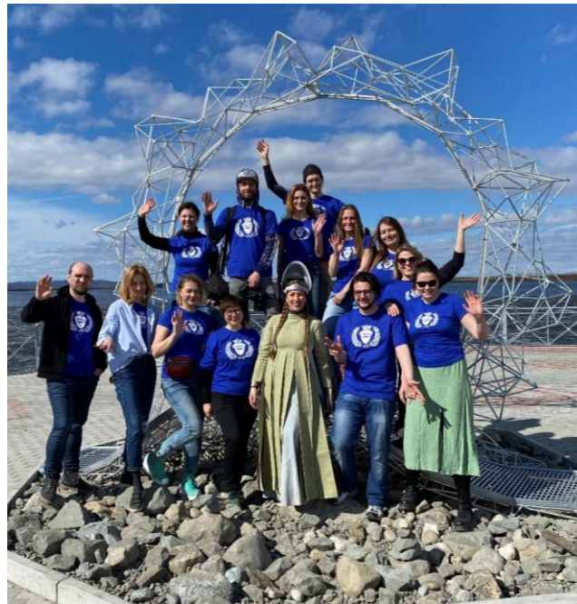
SUN CIRCLE 2021, the Murmansk region

3000 x 4900 x 1700 mm Steel. Welding. Galvanizing.