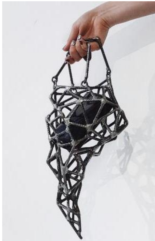
MICROBE №2 2018